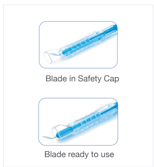
Lance Tip Blade These blades are designed for making corneal/limbal incision. They are found to be very suitable for making side port.