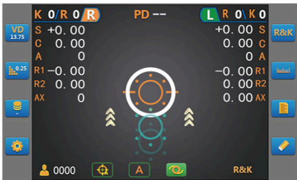
Auto tracking ( Y axis )

Adopt the ARM Cortex-A8 processor, which makes the measurement more faster and accurate. The touch screen provides friendly user interface, and makes the operation more convenient.