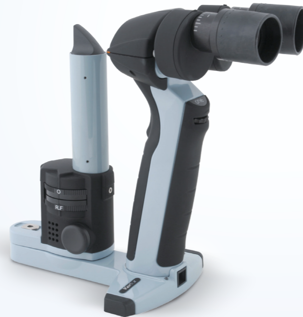
The PSL one 10x magnification