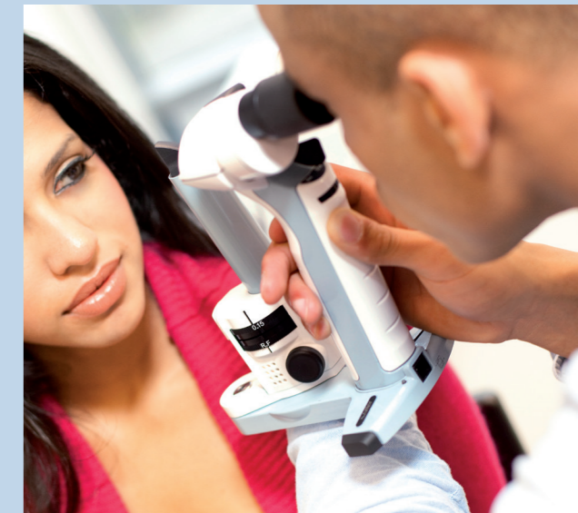
Versatility and portability are key benefits of the Keeler PSL Slit Lamps

Classification: CE Regulation 93/42 EEC: Class I FDA: Class II Production processes, testing, start-up, maintenance, and repairs are conducted in strict conformity with the applicable laws and international reference standards.